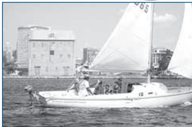
Living Classrooms students sail by the Douglass-Myers Maritime Park.

When completed, the Douglass-Myers Maritime Park will be another vibrant Living Classrooms campus and prominent attraction on